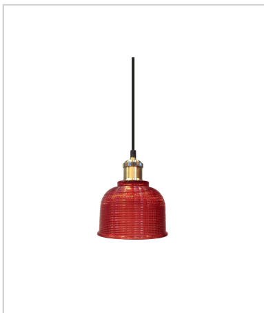
VT-7150 GLASS PENDANT LIGHT-RED 150CM