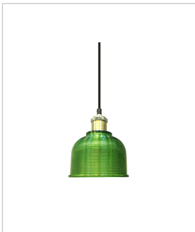
VT-7150 GLASS PENDANT LIGHT-GREEN 150CM