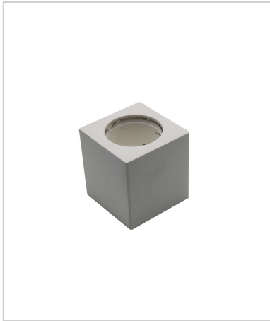
VT-727 1XGU10 FITTING SQUARE - WHITE