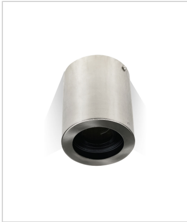
VT-796 GU10 FITTING ROUND SATIN NICKLE