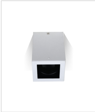
VT-797 GU10 FITTING WHITE SQUARE