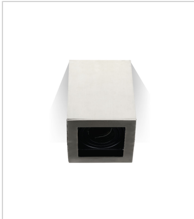
VT-797 GU10 FITTING SATIN NICKLE SQUARE